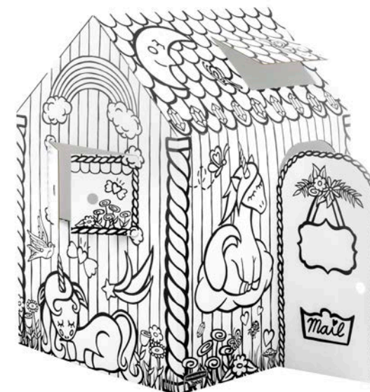
BANKERS BOX® AT PLAY™ Unicorn Playhouse 1230101