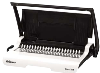
STAR™+ 150 Manual Comb Binding Machine 5006501