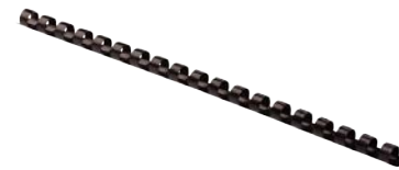
PLASTIC COMBS Round, 1/4", 20 Sheets 52366 - Black, 100 pack