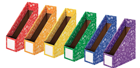
BANKERS BOX® CLASSROOM Magazine Files 3382702 - Assorted Colors