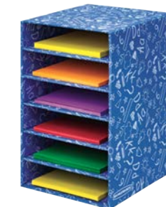
BANKERS BOX® CLASSROOM 6 Compartment Literature Sorter 3384101