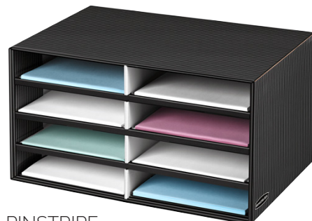
PINSTRIPED Literature Sorter - Letter 6170301