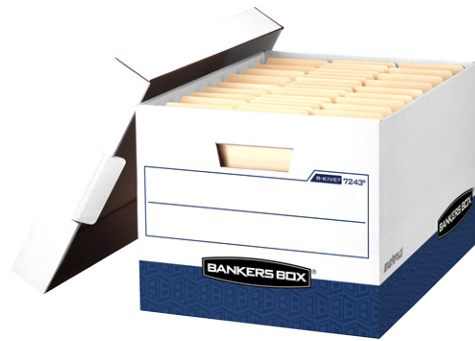
R-KIVE® Heavy-Duty Letter/Legal File Box 07243 White/Blue

Check out free organization tips and tricks from Bankers Box® in our Organization Center at www.bankersbox.ca .