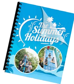
CRYSTALS™ Clear PVC Covers, Letter 52089 - 100 pack