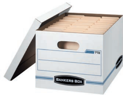
STOR/FILE™ Letter/Legal Box, Lift-Off Lid 00772