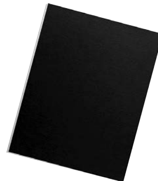
FUTURA™ Presentation Covers, Letter 5224901 - Black, 25 pack