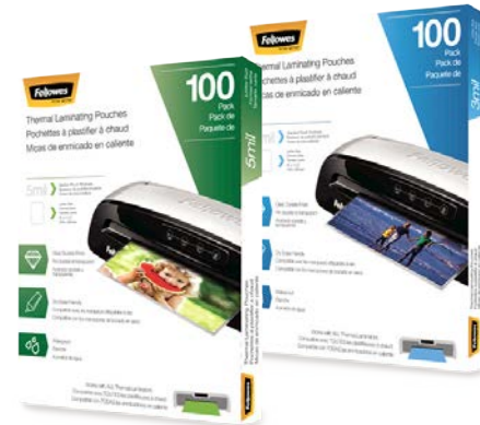
THERMAL LAMINATING Pouches - Letter

5743301 - Letter, 3 mil, 100 pack 5743501 - 5 mil, 100 pack