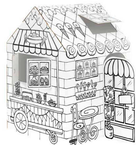
BANKERS BOX® AT PLAY™ Treats 'N' Eats Playhouse 1230201